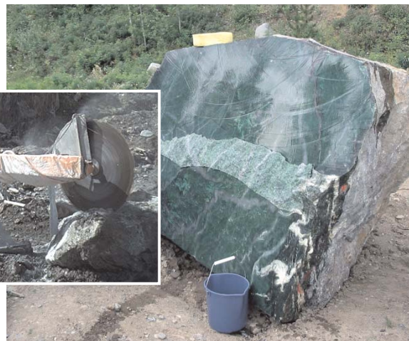
"Polar Pride" jade boulder, from the Polar Jade Mine, near Dease Lake, British Columbia