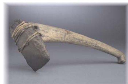
Copper Inuit adze with jade blade, Victoria Island

Canada has the world's largest proven reserves of nephrite, enough to supply world demand for 300 years. Most of Canada's nephrite is found in British Columbia and the Yukon along a belt