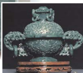
Jade incense burner