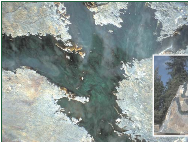
"Emperor's Stone", a 5 tonne boulder from the Polar Jade mine, polished in the shape of a tree

The gemstone known as jade is actually not a single mineral type, but two: nephrite (a silicate of calcium and magnesium) and jadeite (a silicate of sodium and aluminum). They are similar to each other in appearance and hardness, but it was not until 1863 that a French chemist was able to distinguish between the two. However, by then it was too late to straighten out the mineralogical tangle and scientists agreed that the term jade would be used for both.