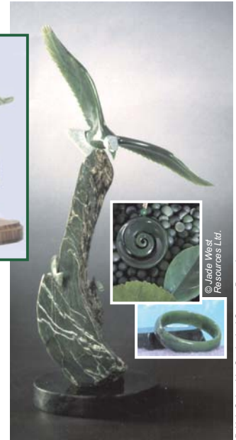
Jade sculptures and jewellery