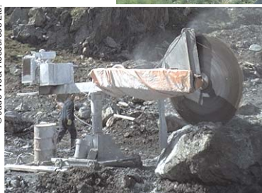
Diamond-tipped saw, cutting jade boulder